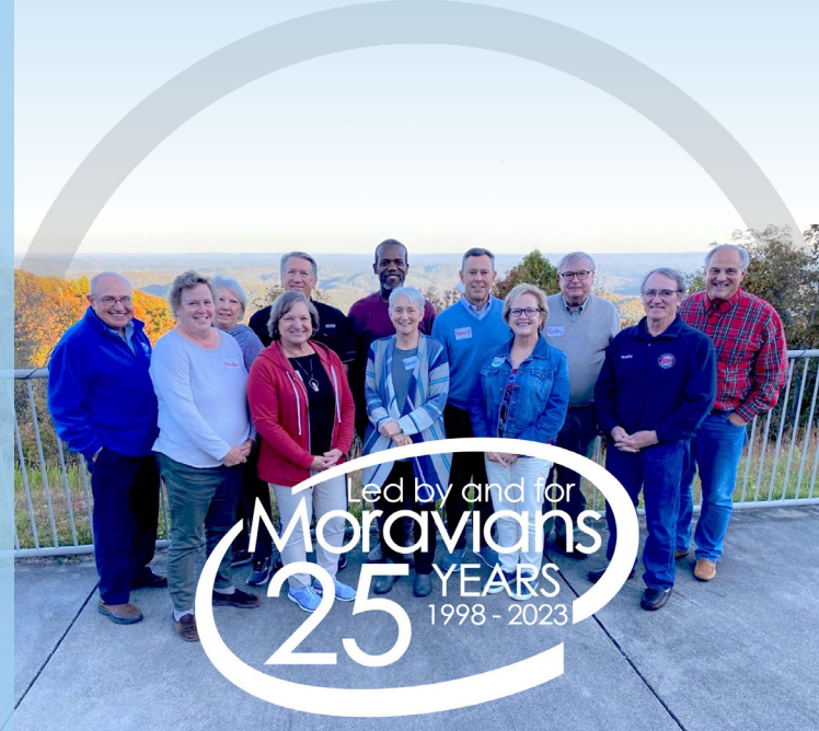
2023 Board of Trustees

of the Moravian Ministries Foundation in America