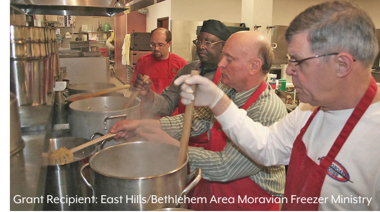
Grant Recipient: East Hills/Bethlehem Area Moravian Freezer Ministry